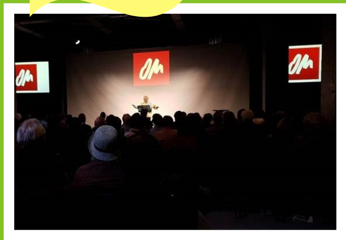
Speaking at a special OM mission event in Cape Town, South Africa , entitled 'Friends of OM'