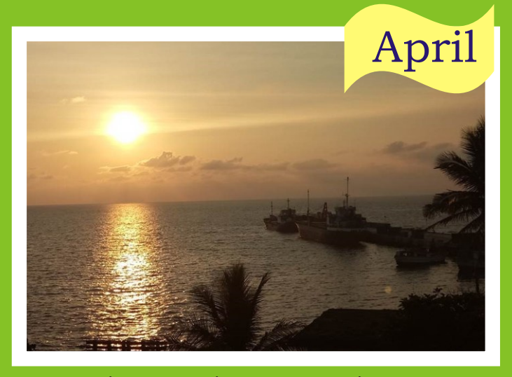
Another spectacular sunset in south-east Asia