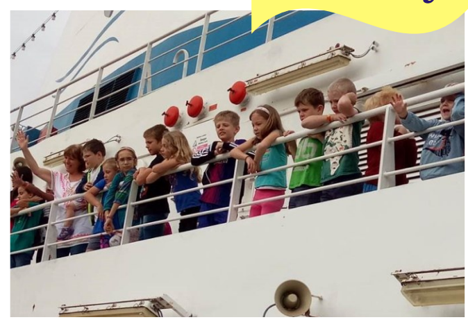
Children from the Logos Hope school watch the arrival of the ship into another port in South America