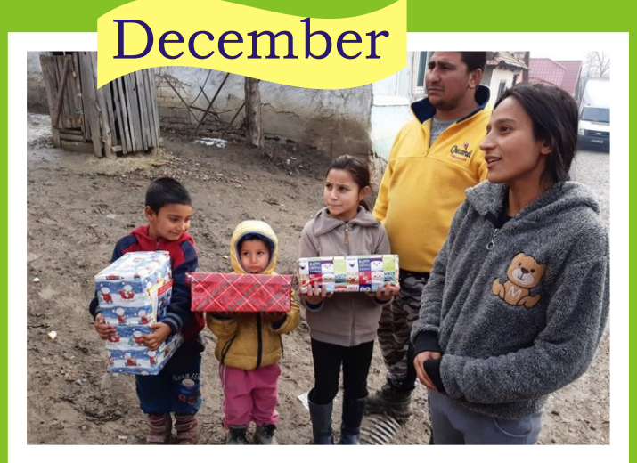
Some of the 2500 shoeboxes AMEN collected from around the UK and distributed in Romania for Christmas