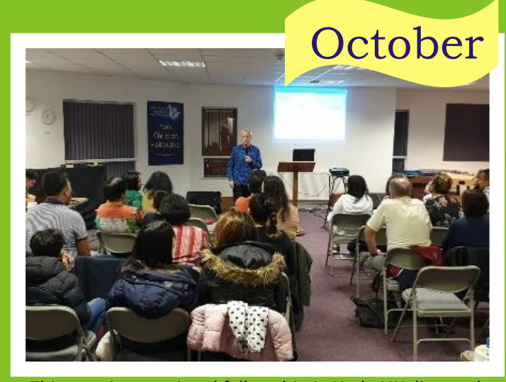
This new international fellowship in York, UK , listened well when hearing news about the worldwide church